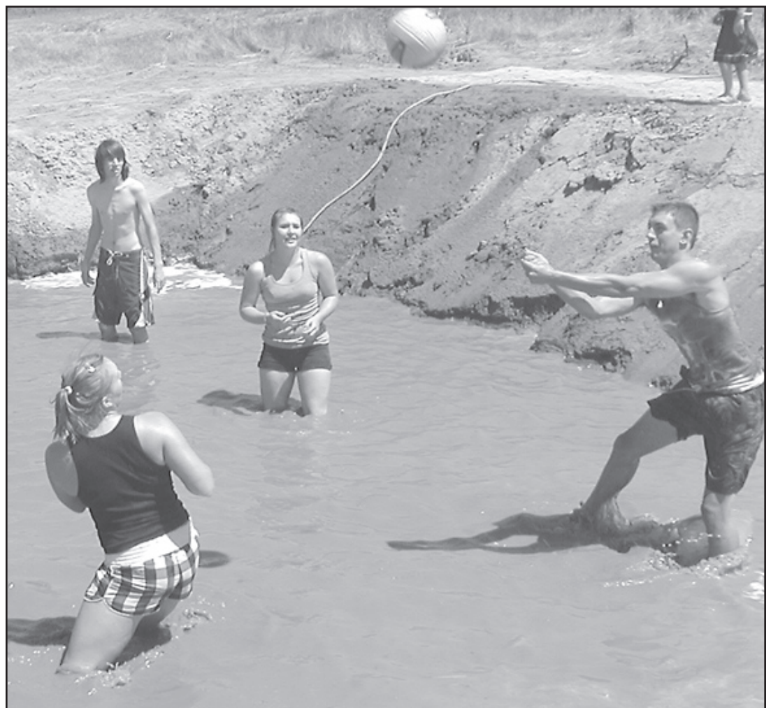
MUD VOLLEYBALL TOURNAMENT was held Saturday after the parade.