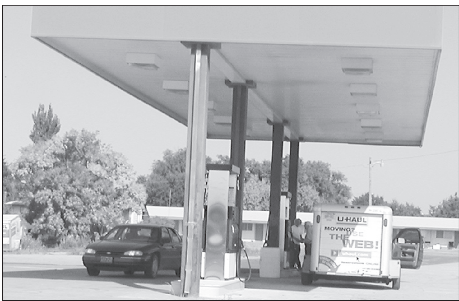
MAJESTIC SERVICE is now pumping gasoline just in time for the busy Labor Day weekend.