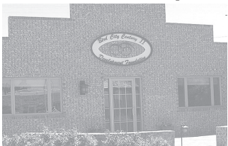
Bird City Century II Development Foundation PO Box 593, Bird City, KS 67731