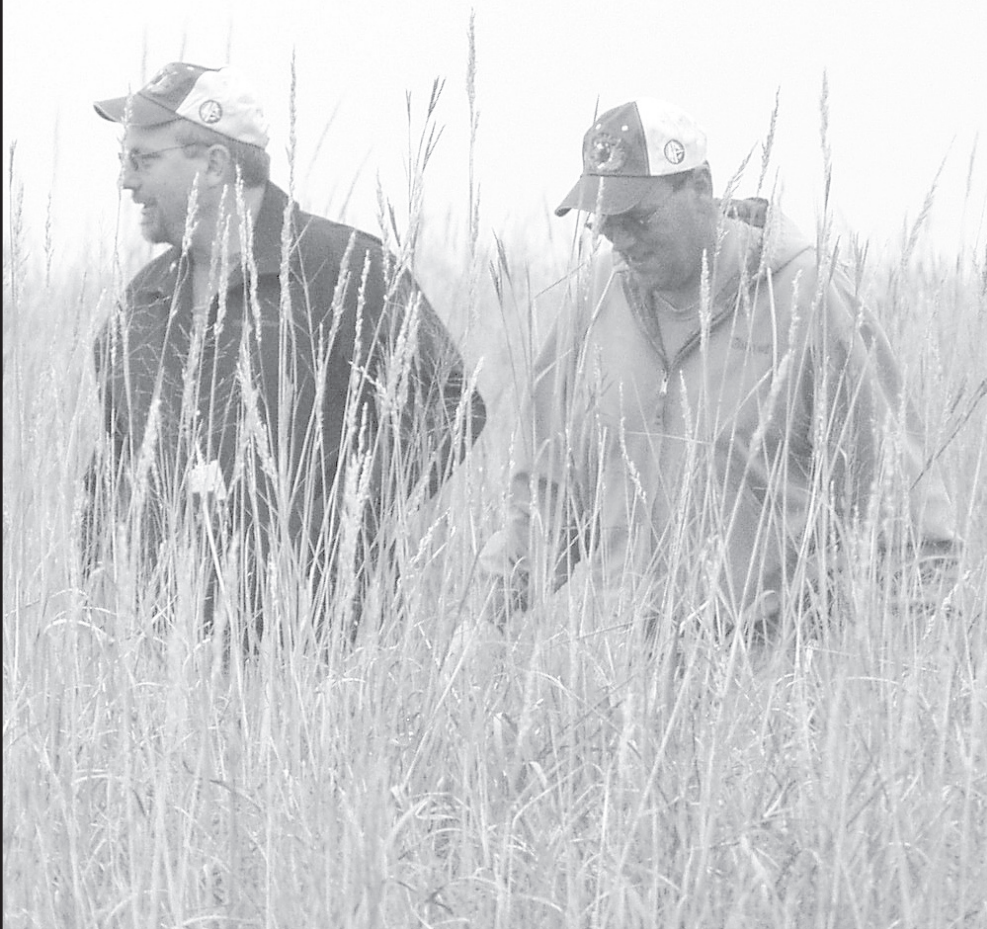
Mentor hunters assist a youth at a Pheasants Forever Mentor Hunting Day.