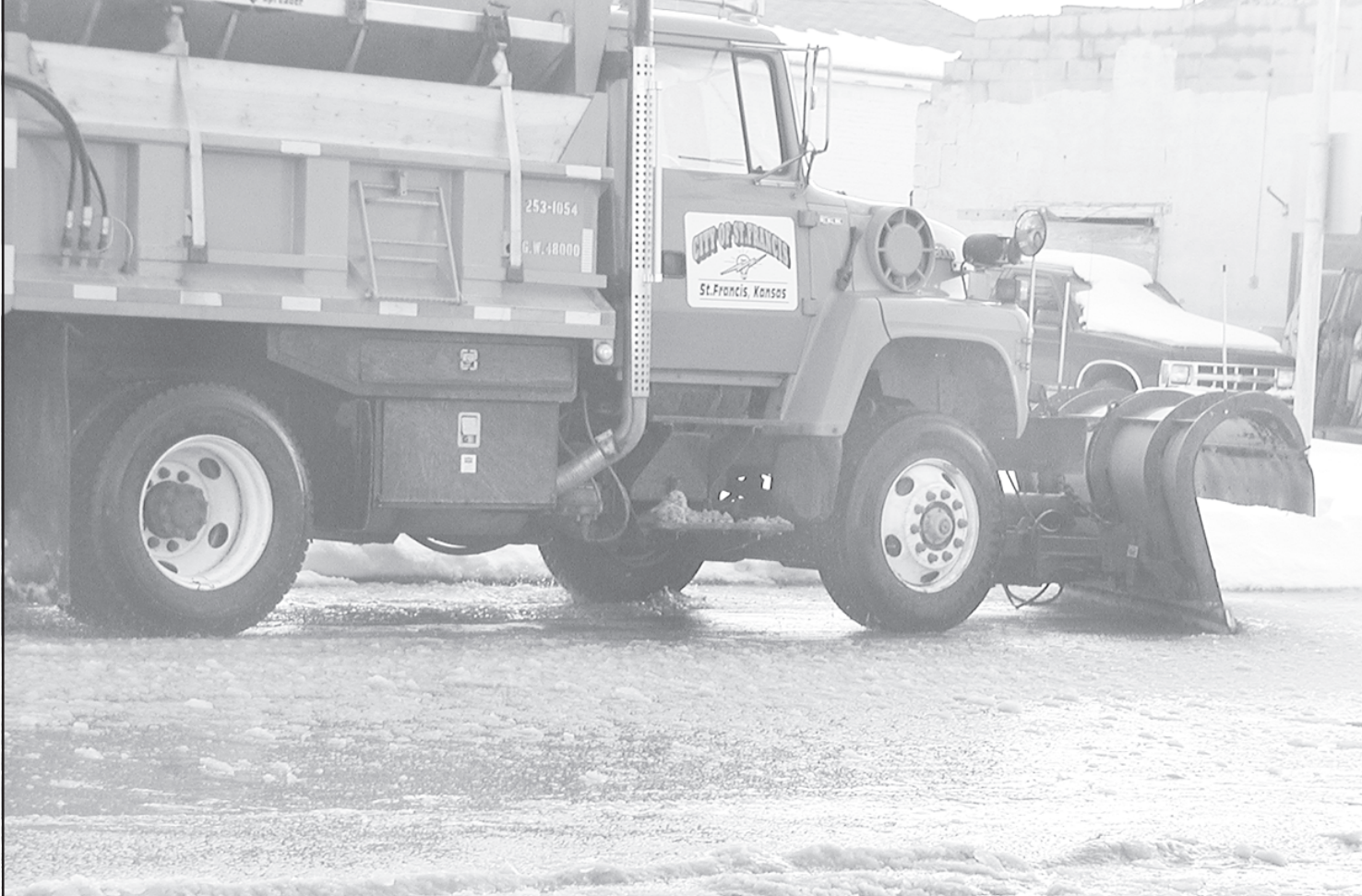
CITY TRUCK has been busy the last few weeks, first clearing snow and now the slushy ice. As the temperatures have reached in the upper 30s and lower 40s the past few days, the snow is slowly melting only for a new forecasted storm schedule to come in Thursday and Friday.