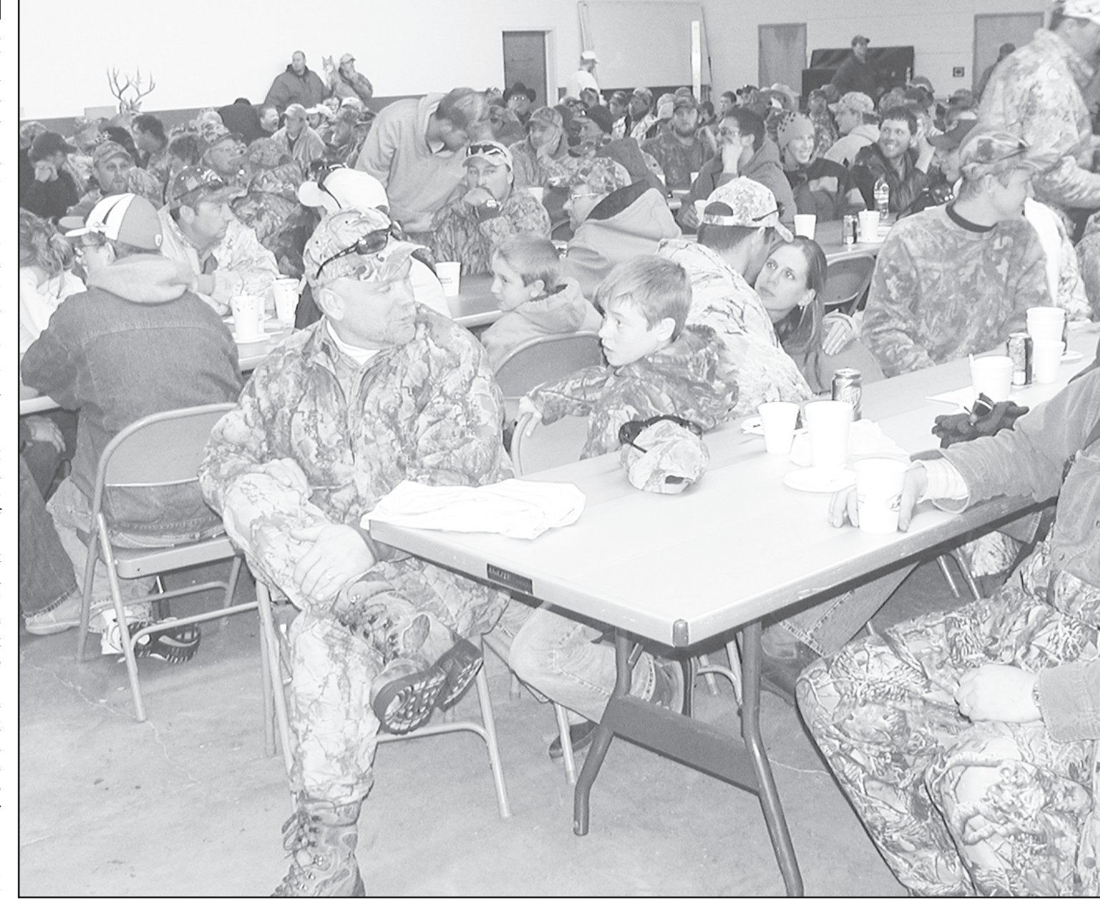
CROWD GATHERED — The 4-H building at the fairgrounds ment of the winners of the contest and see if their name would in St. Francis was full as people gathered to hear the announce- be drawn for a prize.