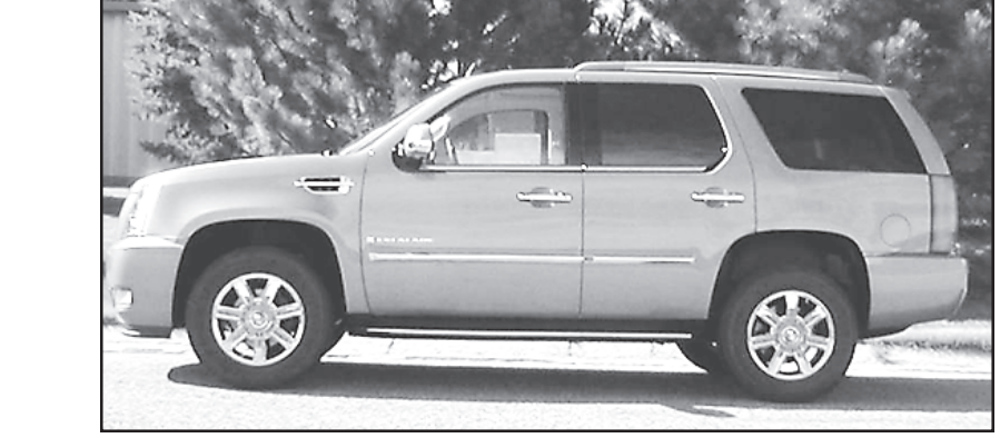
2007 Cadillac Escalade