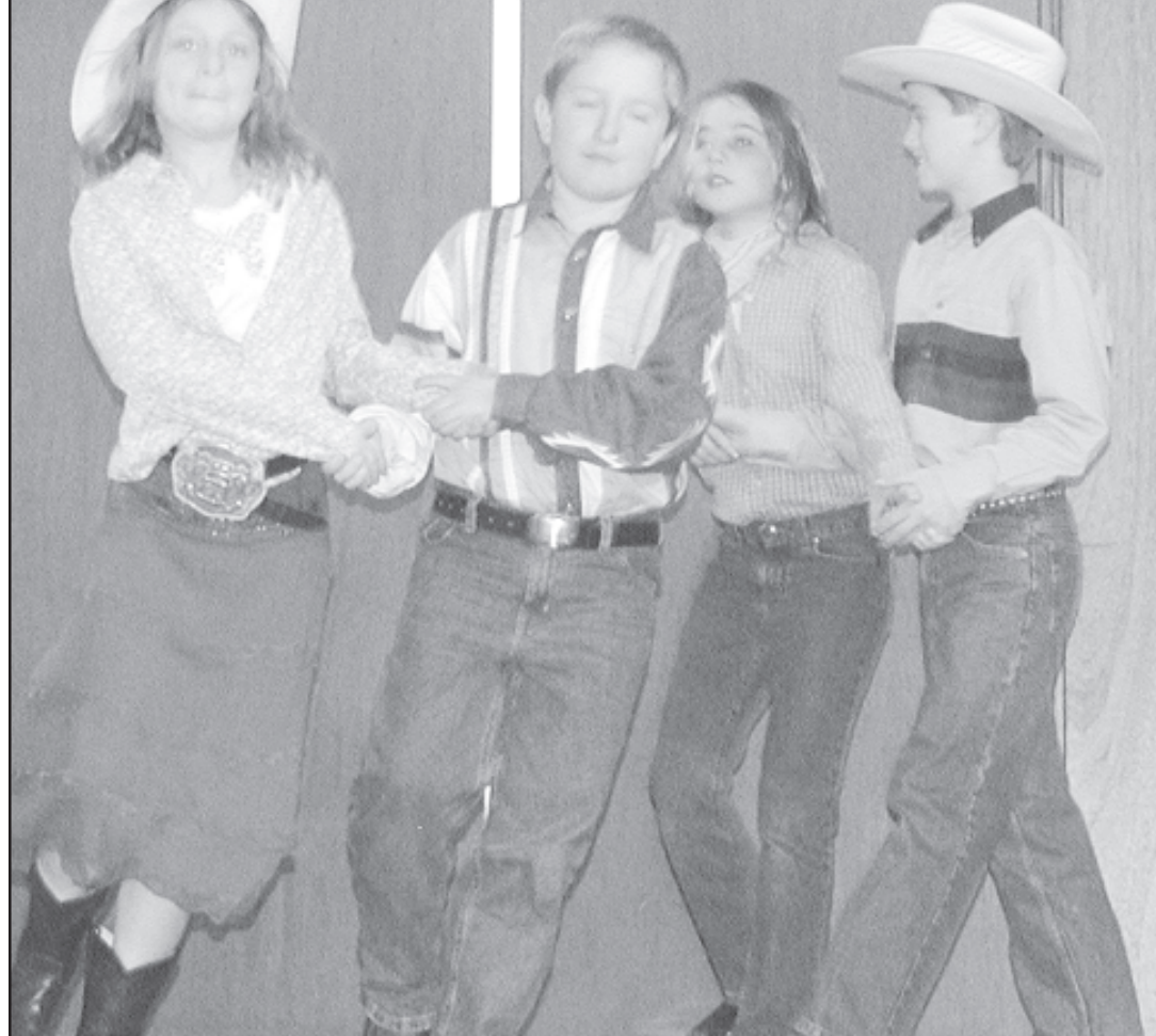
THIRD GRADE STUDENTS entertained those at Kansas Day with some square dancing and singing.