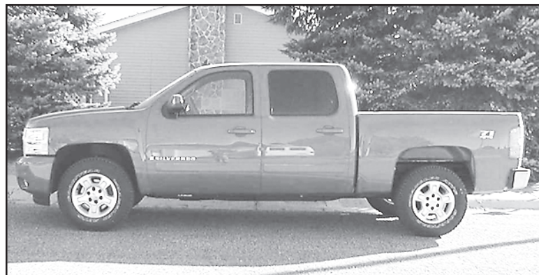
2007 Chevy LTZ 1/2 ton Crew Cab Pick Up