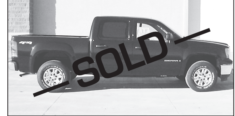
2007 GMC 1/2 ton Crew Cab Pickup