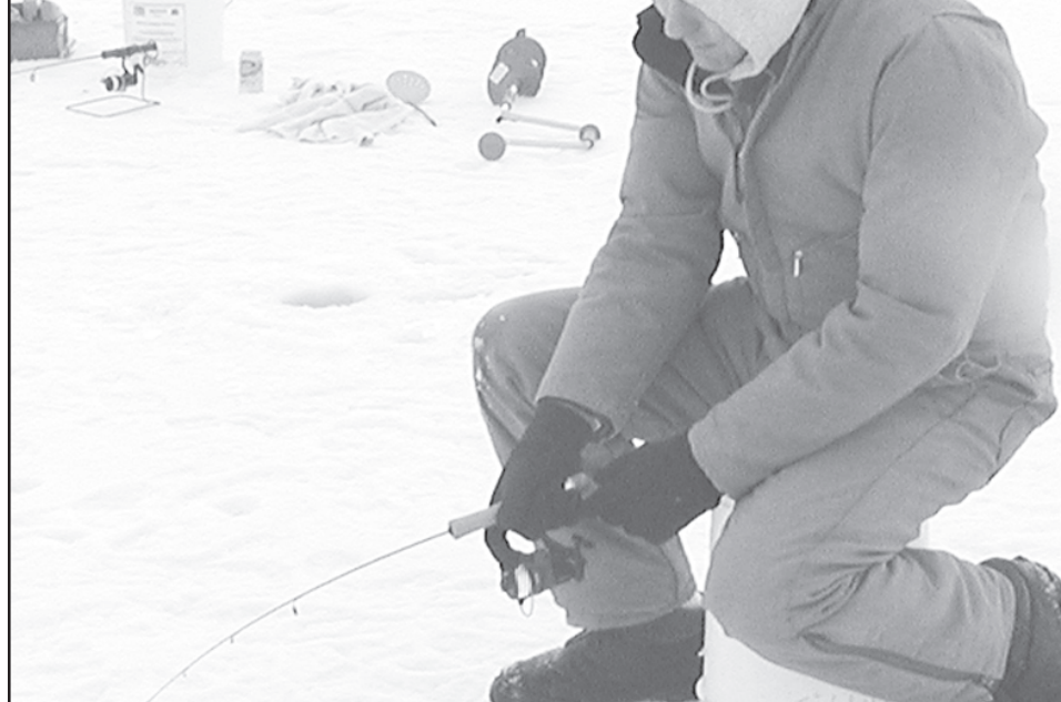
ICE WAS THICK and fishermen could do some ice fishing at Keller Pond on Feb. 11. However, temperatures have warmed with the high being 50 degrees on Monday.