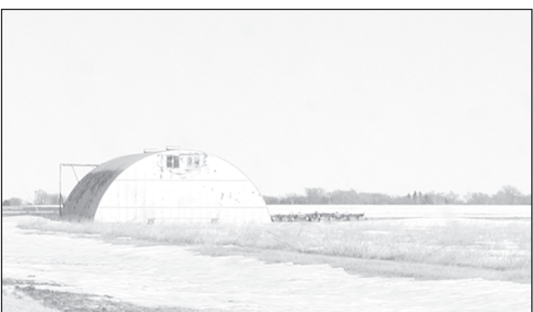
PARALYZING BLIZZARD again hit the Tri-County area Saturday, leaving several highways closed both west and east bound.

within 15 calendar days after the disaster occurrence, or the date the loss becomes apparent to the producer. Producers are limited to $100,000 in benefits per person per crop year, they must certify crop acres by applicable deadlines, maintain production evidence for 3 years, not exceed the $2 million gross revenue provisions, and must comply with conservation compliance provisions in order to be eligible. Interested producers shall contact their local Farm Service Agency at the USDA Service Center prior to the March 15 application closing date to obtain NAP coverage.