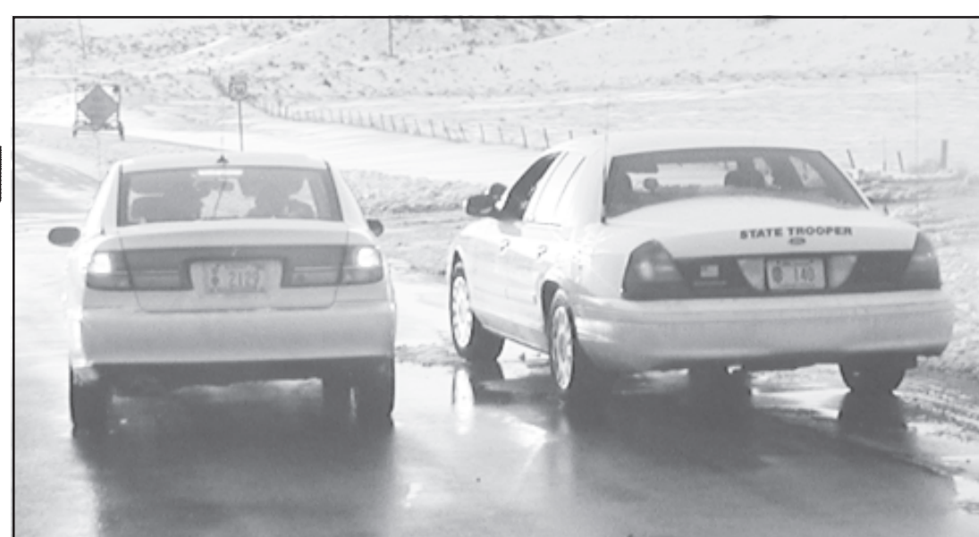
U.S. 36 CLOSED once again last Saturday as blizzard conditions hit the tri-state area. The highway was closed from Atwood both east and west bound.