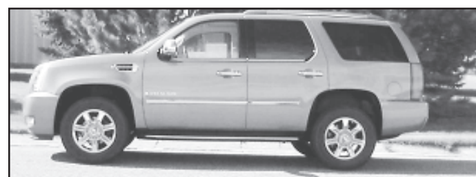
2007 Cadillac Escalade, Bronze