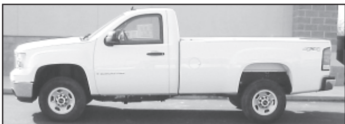
2007 GMC 3/4 T, Reg. Cab, 4x4, White