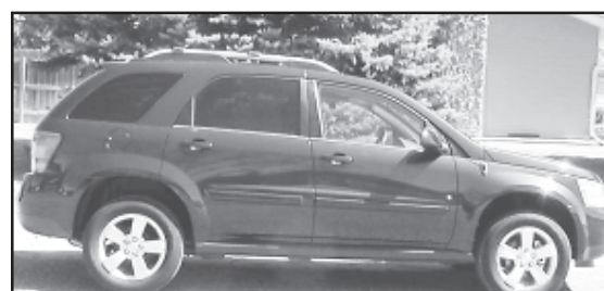
2006 Pontiac Torrent, Blue Streak