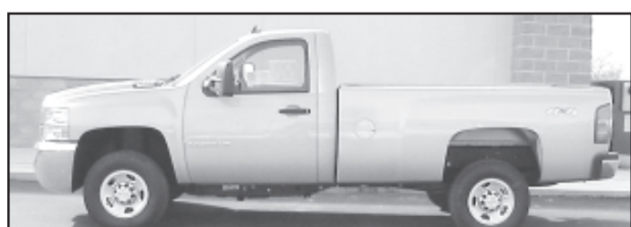
2007 Chevrolet 3/4 T, Reg. Cab, 4x4, Silver