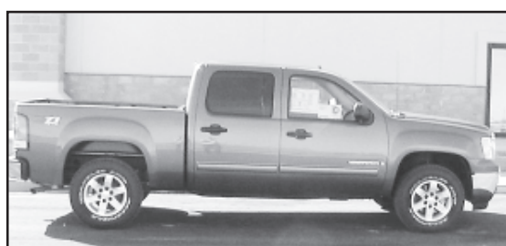
2007 GMC Crew Cab