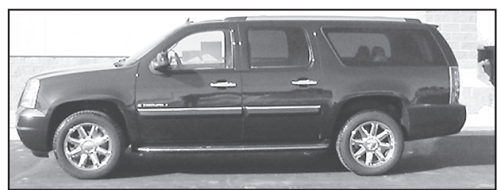
2007 GMC Yukon XL Denali