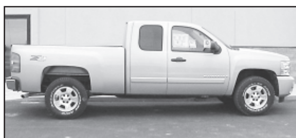
2007 Chevy Ext-Cab