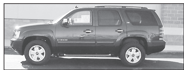
2007 Chevy Tahoe