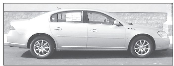
2007 Buick Lucerne