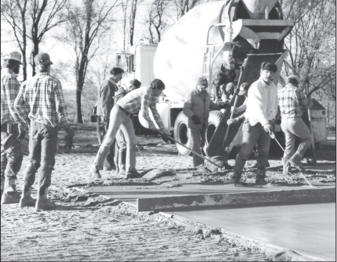
VOLUNTEERS gathered to begin the construction of the new museum. An open house is set to commemorate the history from when the museum was established.