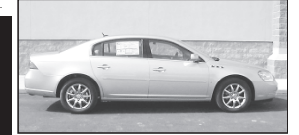
2007 Buick Lucerne, Platinim