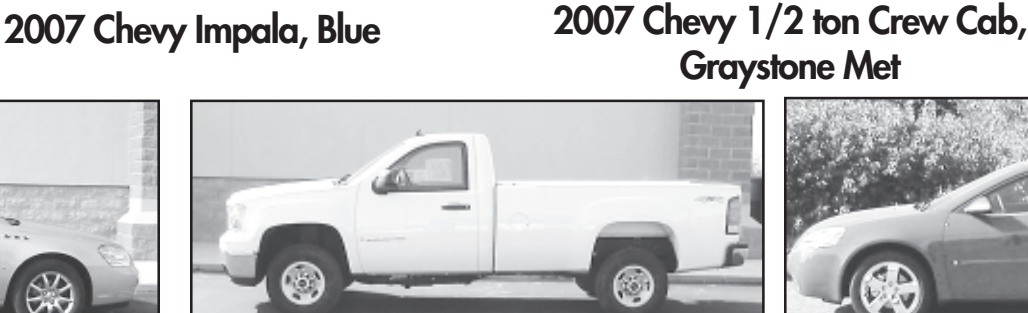
2007 GMC 3/4 ton, White