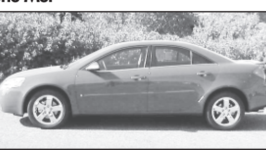
2007 Pontiac G6, Red