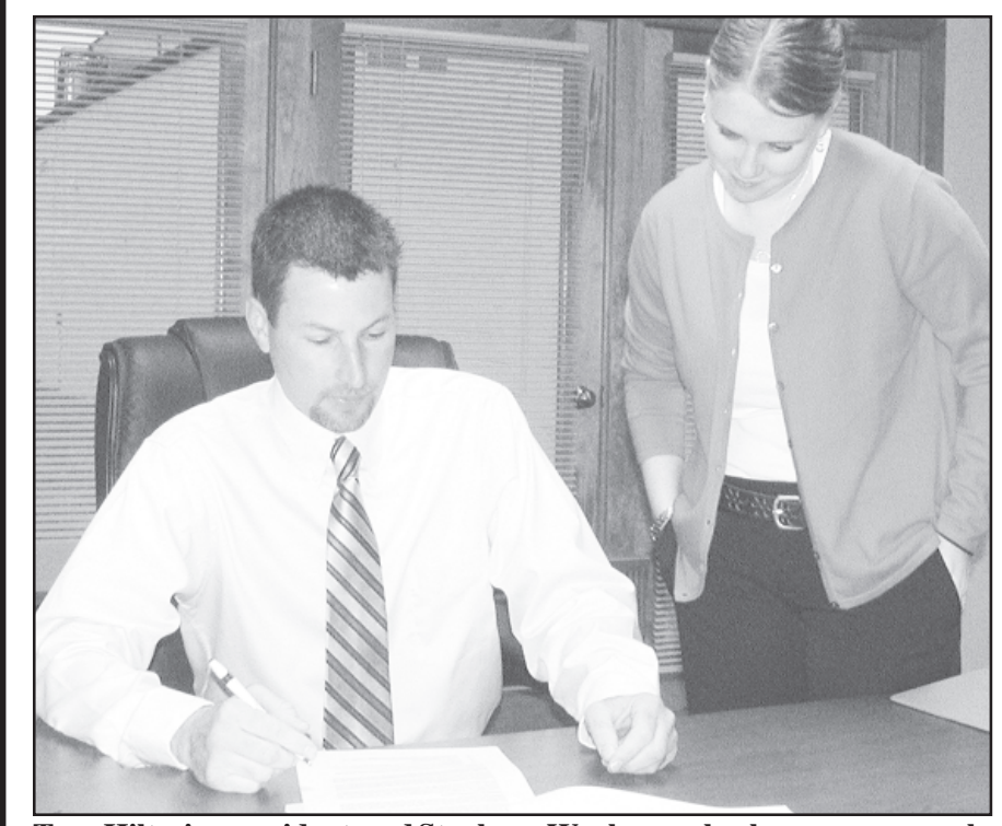
St. Francis man assumes duties as vice president of new bank