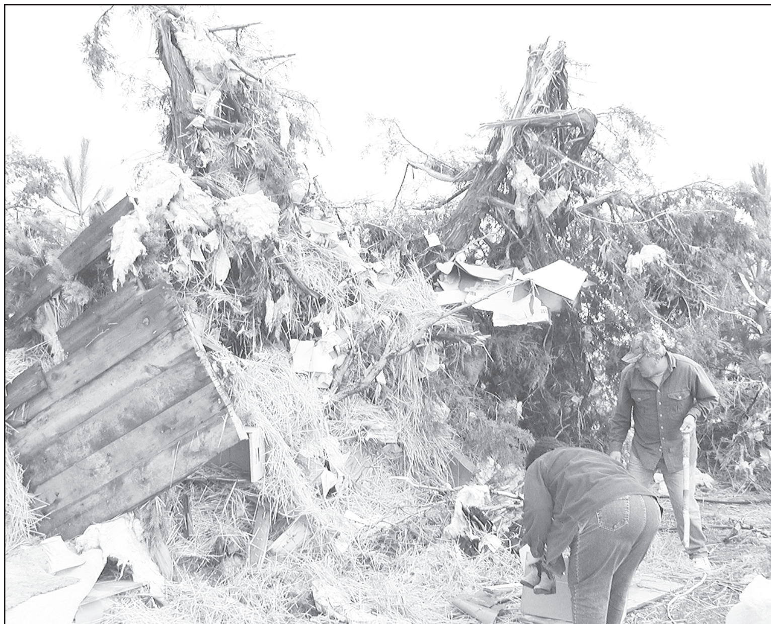
THE GLASCO FARM damage after the tornado on March 28.