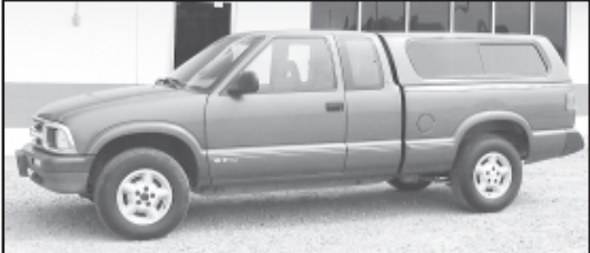
1995 Chevrolet S10 Extra Cab 4x4