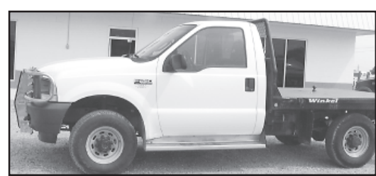
2003 Ford F250 4x4 XL