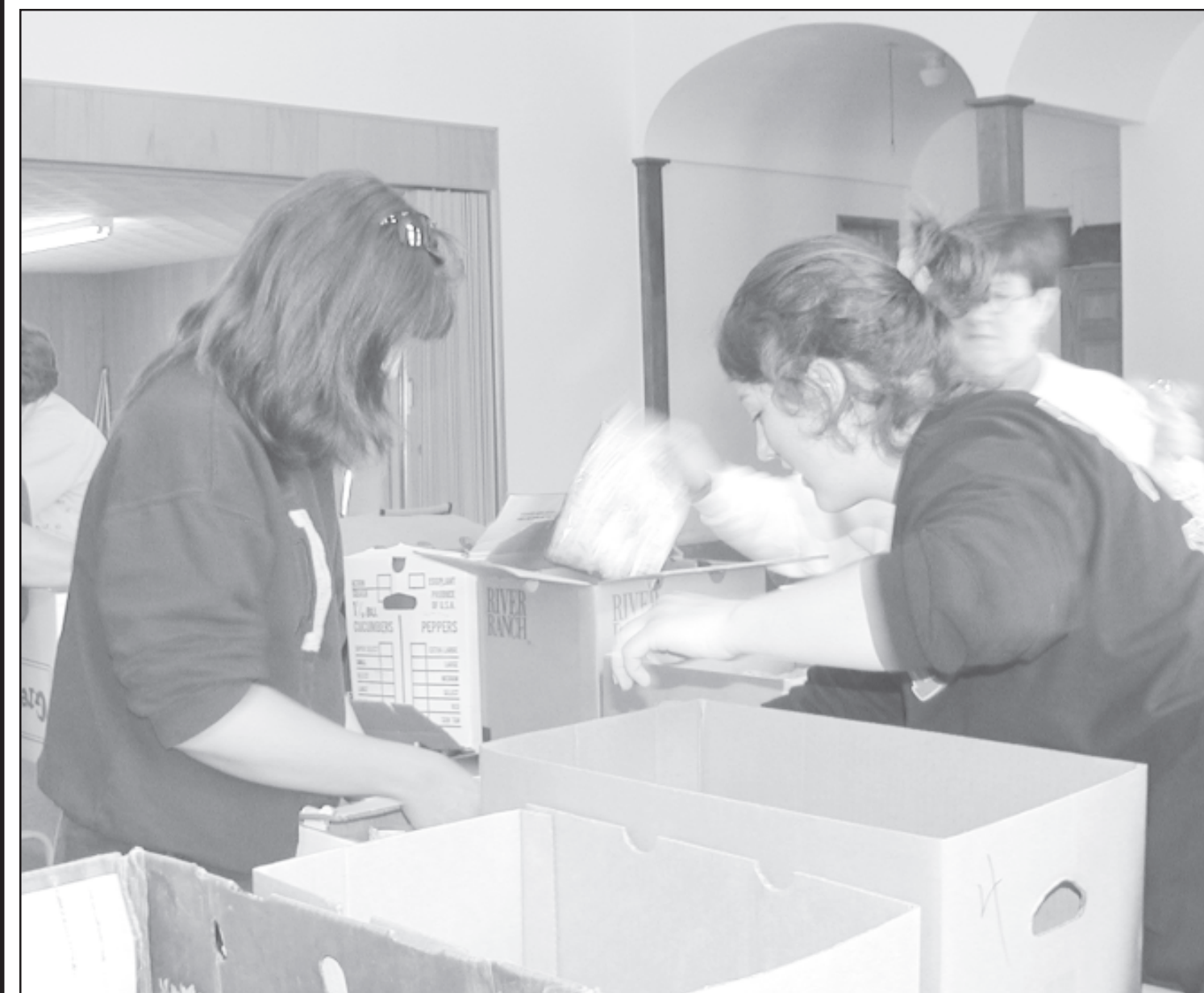
PRAIRIE LAND FOOD has been distributing boxes of food at the First Baptist church for the past several months. The program requires a small fee and volunteer hours. For

Call the Cheyenne County Service Center for additional information.