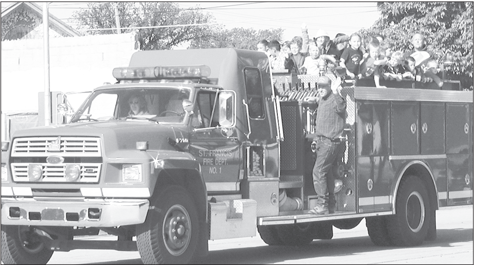
On the last day of school, kindergarten students take a ride around town on the fire truck, lights flashing and siren sounding.