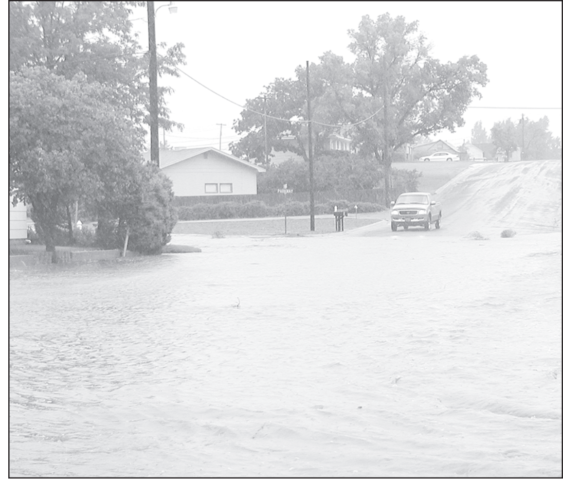
THE WATER is up over the curbs at the end of Parkway Drive during the heavy rains on Tuesday.

(785) 890-3639 The Scoular Company (formerly Mueller Grain Co.) is taking applications for harvest help for the 2007 wheat harvest. This will be a part time position. The job will be helping unload trucks and housekeeping. Hours may be flexible. To apply,