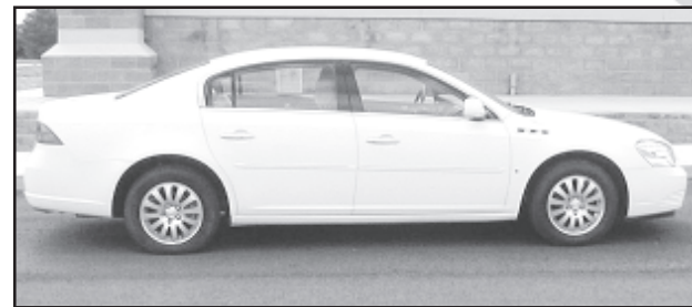
2006 Buick Lucerne, White, Cloth, CD Player