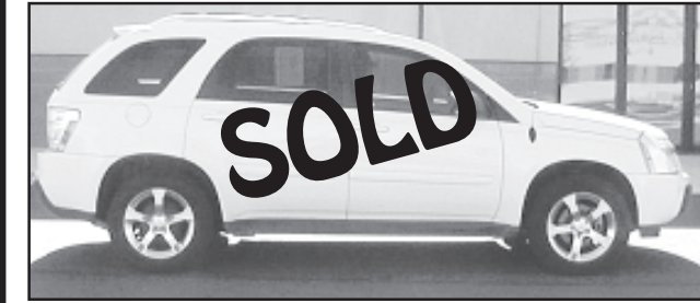
2005 Chevy Equinox, AWD, White, Cloth, CD Player