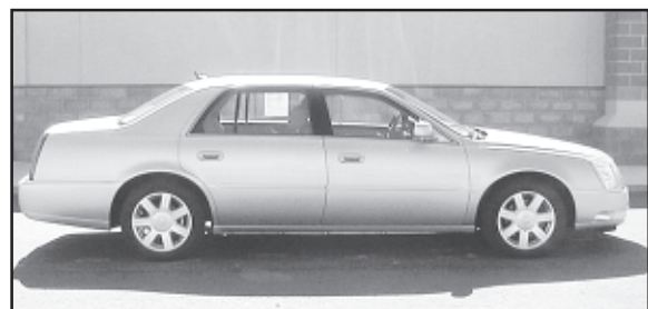
2007 Cadillac DTS, Silver, Leather, CD Player