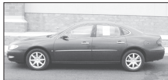
2006 Buick Lacrosse, Blue, Leather, CD Player