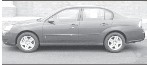
2007 Chevy Malibu, Maroon, Cloth, CD Player