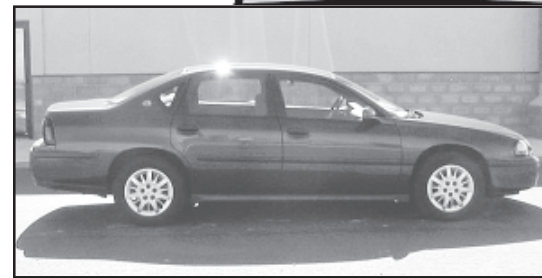
2004 Chevy Impala, Blue, Cloth, CD Player