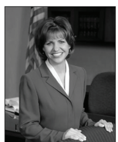
Lynn Jenkins, CPA Kansas State Treasurer

"Each year $12 to $15 million worth of new unclaimed money & property is added to our database. Find out if any belongs to you or your friends and family! Contact my office today at no cost to you - regardless of the claim amount!"