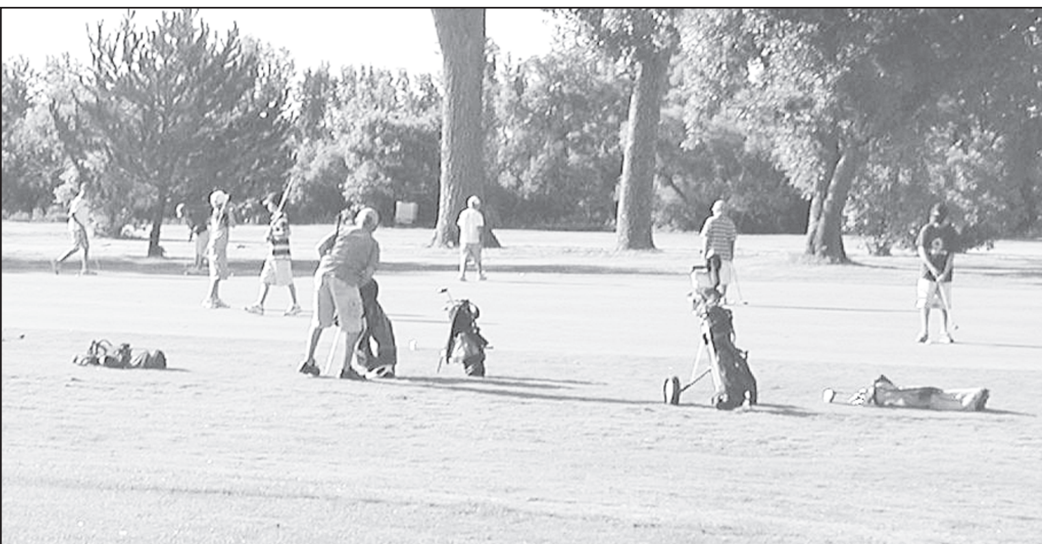
THE PUTTING GREEN was a popular place Monday morning as the junior golfers warmed up for the tournament.