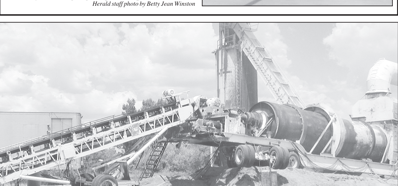
ASPHALT PLANT is set up west of St. Francis. Mix is heated in the huge fire-burning cylinder.