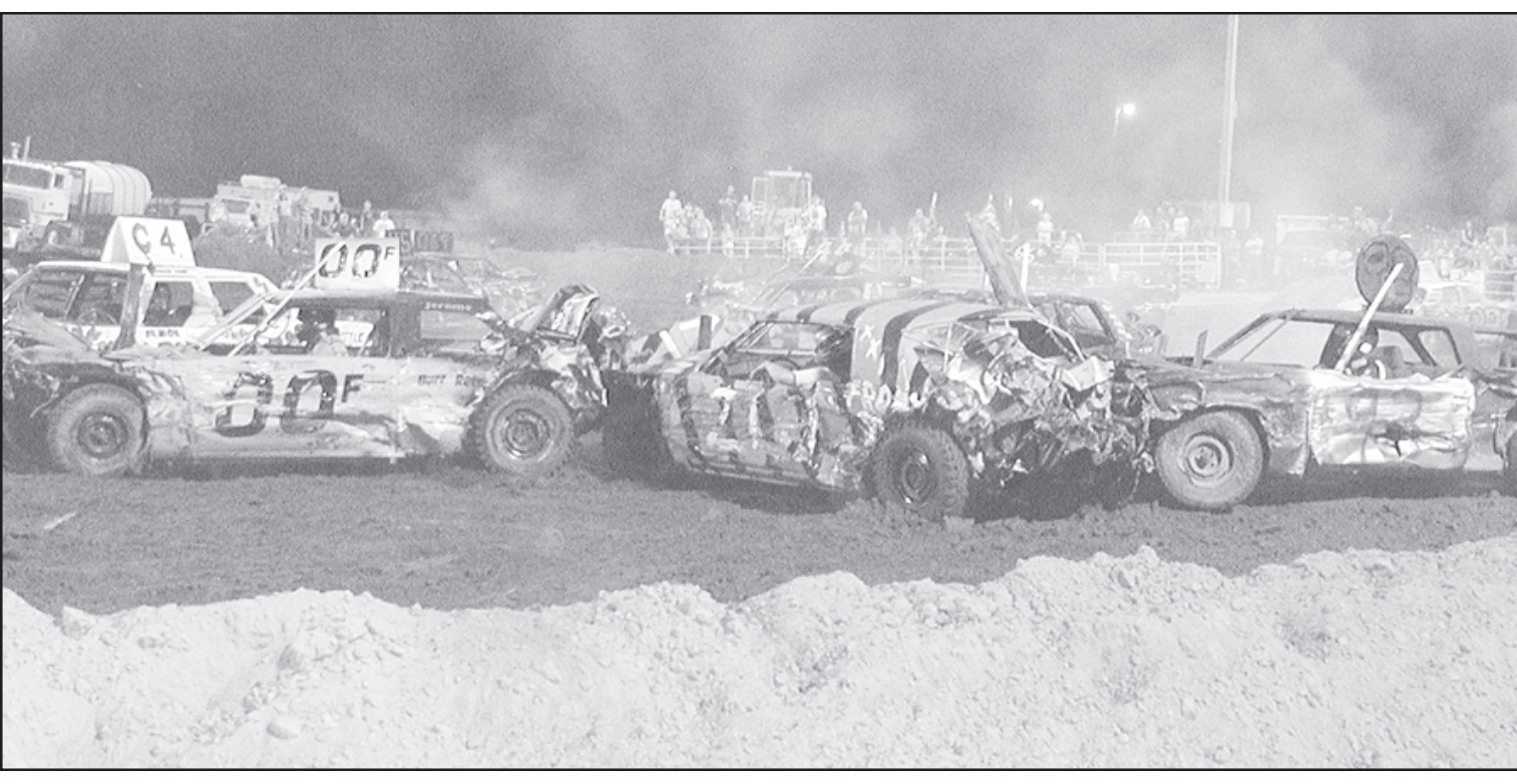
CLOUDS OF DUST were in the air when the action was over at the 2006 demolition derby. The fair derby was one of the biggest derbies in the area. Another big derby is planned for Saturday at the fair.