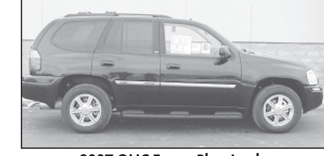
2007 GMC Envoy, Blue, Leather