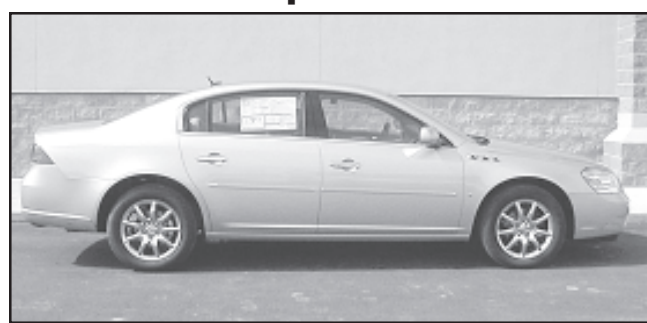
2007 Buick Lucerne, Platinum, Leather