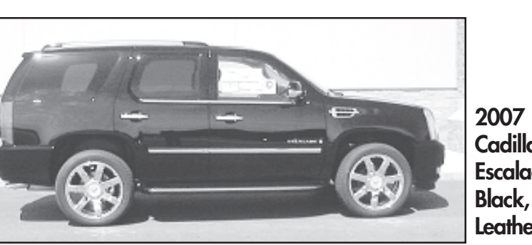
Cadillac Escalade, Leather