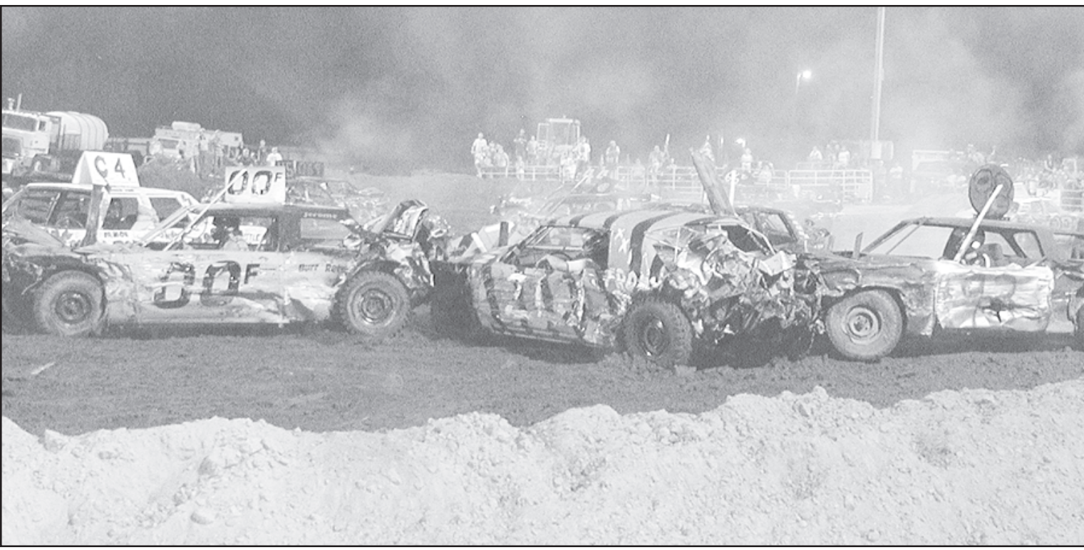
CLOUDS OF DUST were in the air when the action was over at the 2006 demolition derby. The fair derby was one of the biggest derbies in the area. Another big derby is planned for Saturday at the fair.