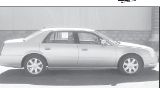
2007 Cadillac DTS, Silver, Leather, Heated and Cool Seats, CD Player