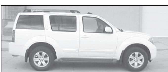
2005 Nissan Pathfinder, White, Leather, Sunroof, DVD Nav/System