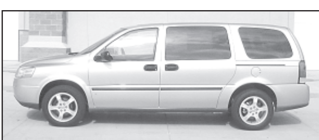
2007 Chevy Uplander Van, Silver, Cloth, CD Player

Looking for a Good Used Car or Pickup! We have a GREAT SELECTION In Stock NOW! We also carry the full line of New GM Cars & Pickups with 0% Financing or up to $4,000 Consumer Rebate on Select Models.