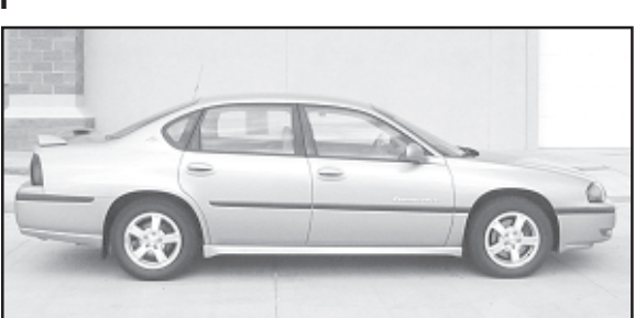
2003 Chevy Impala, Leather, CD Player