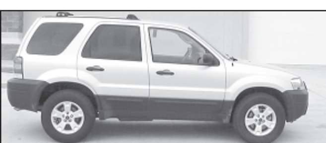
2005 Ford Escape XLT, Silver, Cloth, CD Player