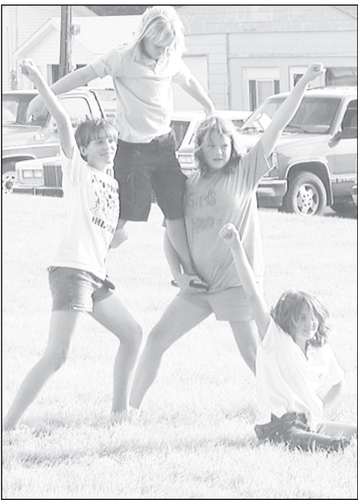
GIRLS OF ALL AGES took part in the cheer camp held last week. The future cheerleaders showed their talent on Friday night in front of a crowd.