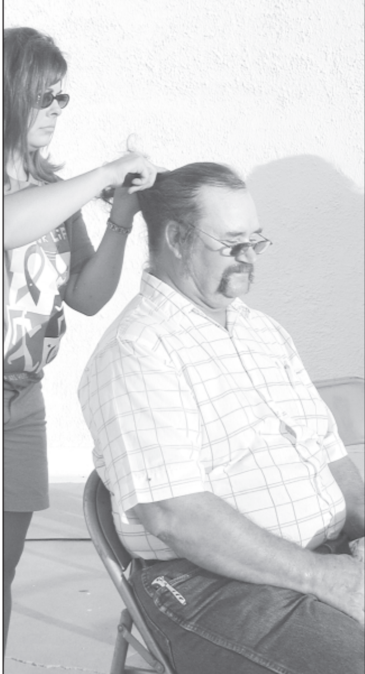
"LOCKS OF LOVE" ceremony was held Saturday during the eighth annual American Cancer Society Relay for Life. Those donating hair to 'Locks of Love' individuals have at least 10 inches of hair to be cut and donate that hair for wigs