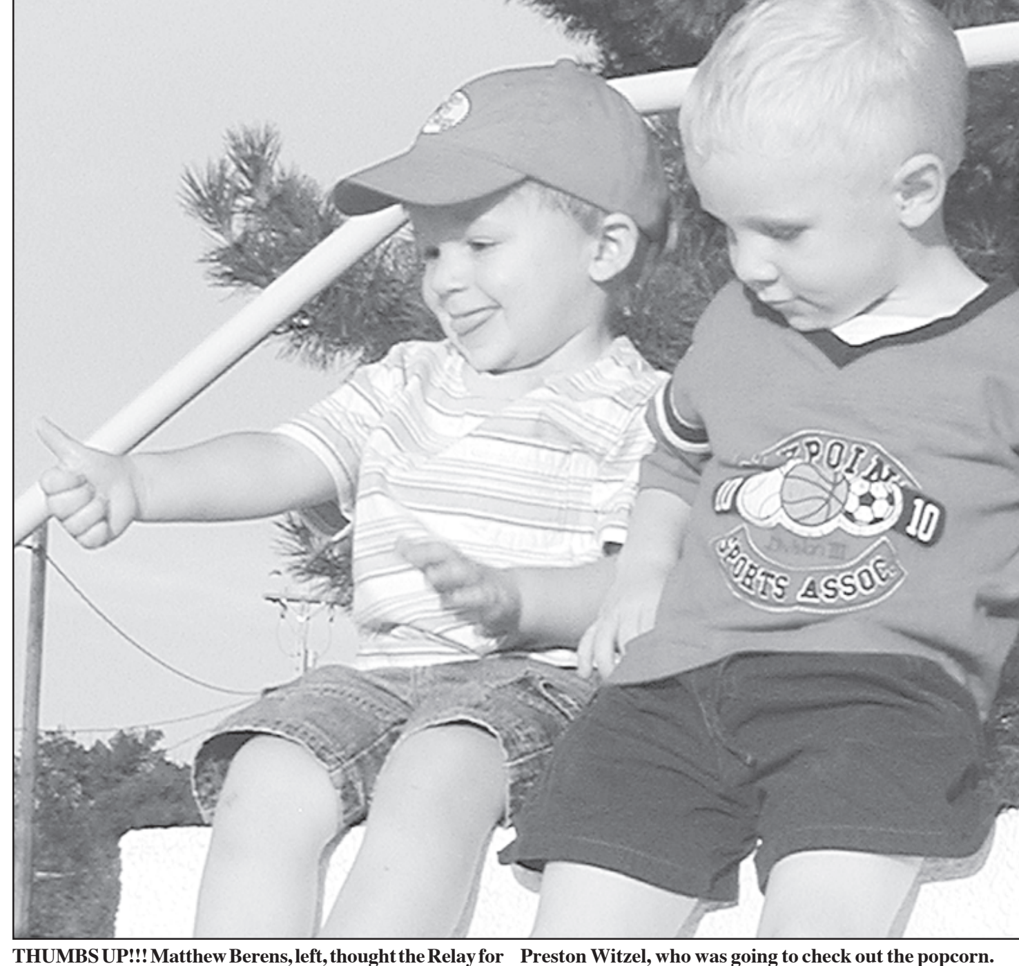
Life activities was lots of fun Saturday evening. So did