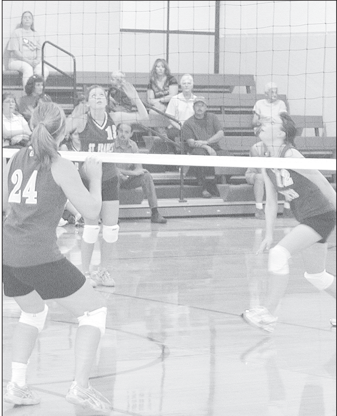
A SCRIMMAGE was held at the open house Friday. The Lady Indians displayed some of their newly acquired skills.