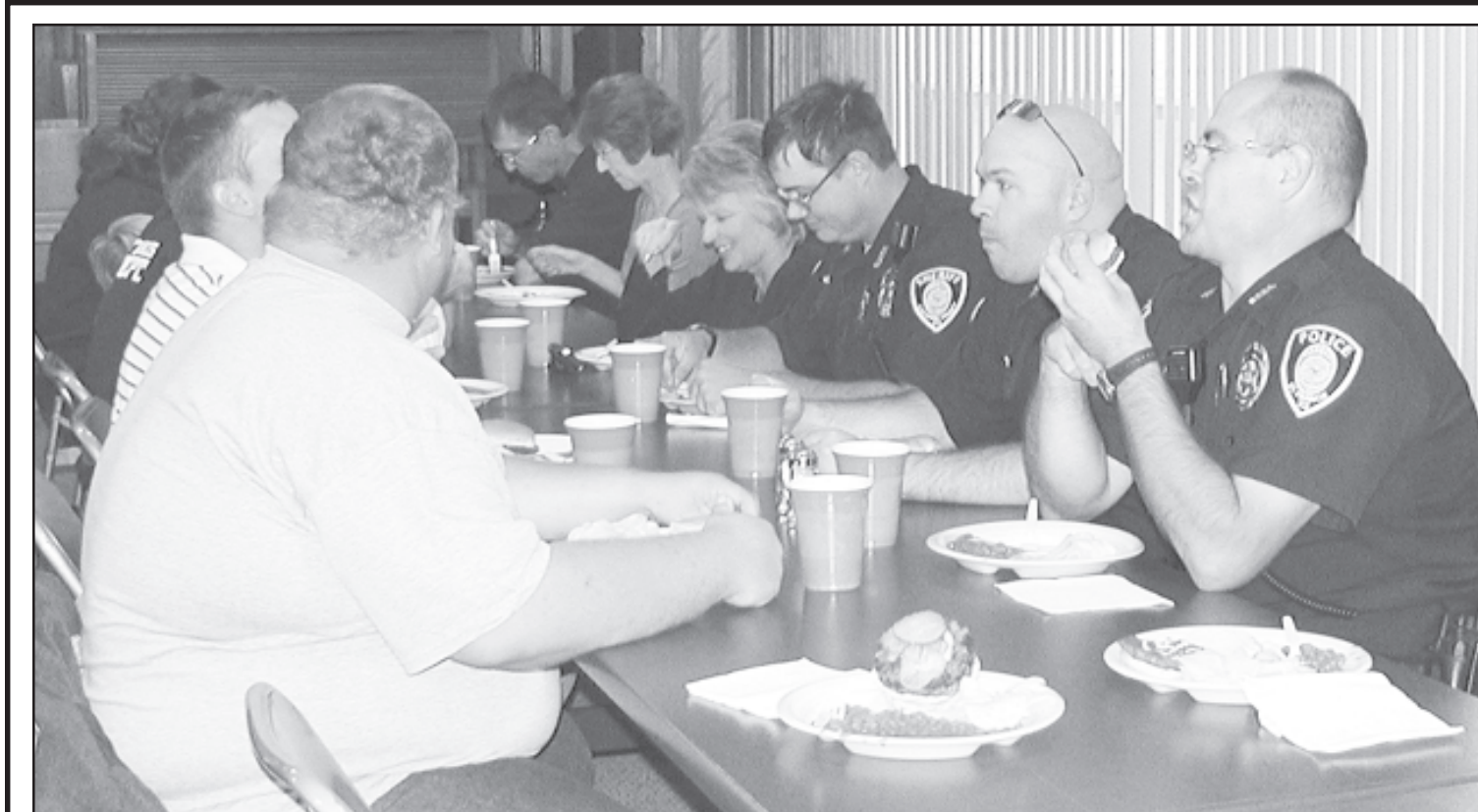
AN APPRECIATION SUPPER is held for the local law enforcement, fire department and emergency responders at the United Methodist Church on Sunday.