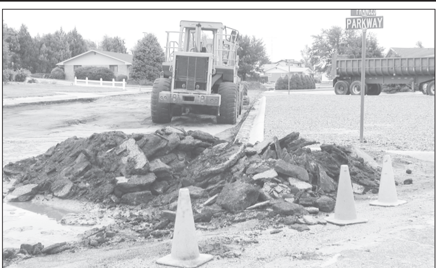
STREET WORK BEGINS on Parkway Drive. The street repairs have been a controversial matter with residents and

Thursday, Sept. 20: High school volleyball, St. Francis, Dund County/Benkelman, Chase County, Imperial at Benkelman, 5 p.m.; junior high volleyball, Rawlins County at Atwood, there, 4:30 p.m.; junior high football, Rawlins County at Atwood, there, 5:30.