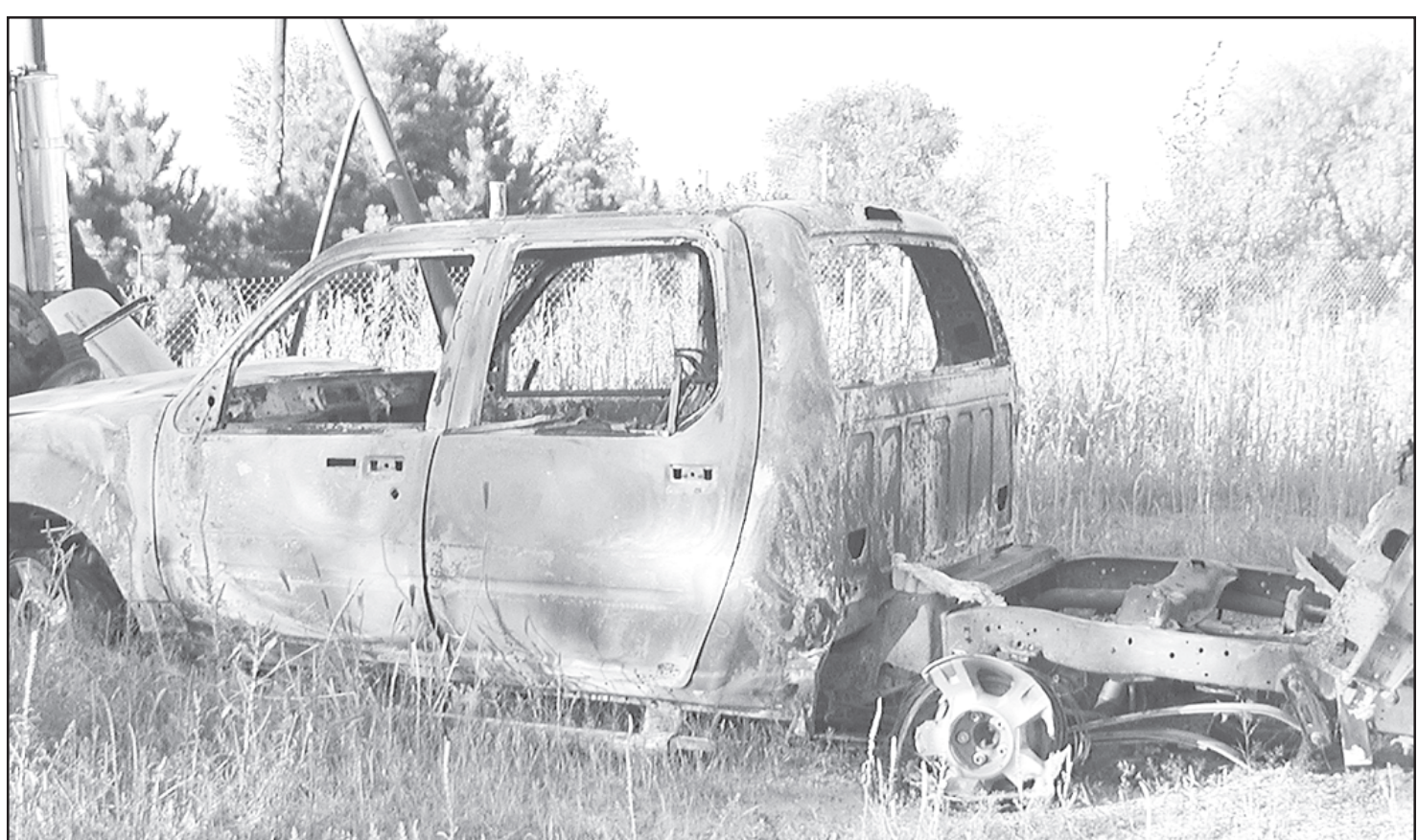
TORCHED PICKUP was brought to town by the Cheyenne County Sheriff officers Monday morning. The pickup was burned to the point that there was little identification, no

Information about 2008 program is available on the Web site at www.ks.nrcs.usda.gov/programs/eqip/2008 or at your local Service Center. This will include information about 2008 program — Kansas fact sheet; the Kansas Self-Assessment Worksheets; an application form; a list of eligible practices and payment rates; and specifics on Kansas's ranking process, including criteria used to evaluate applications.