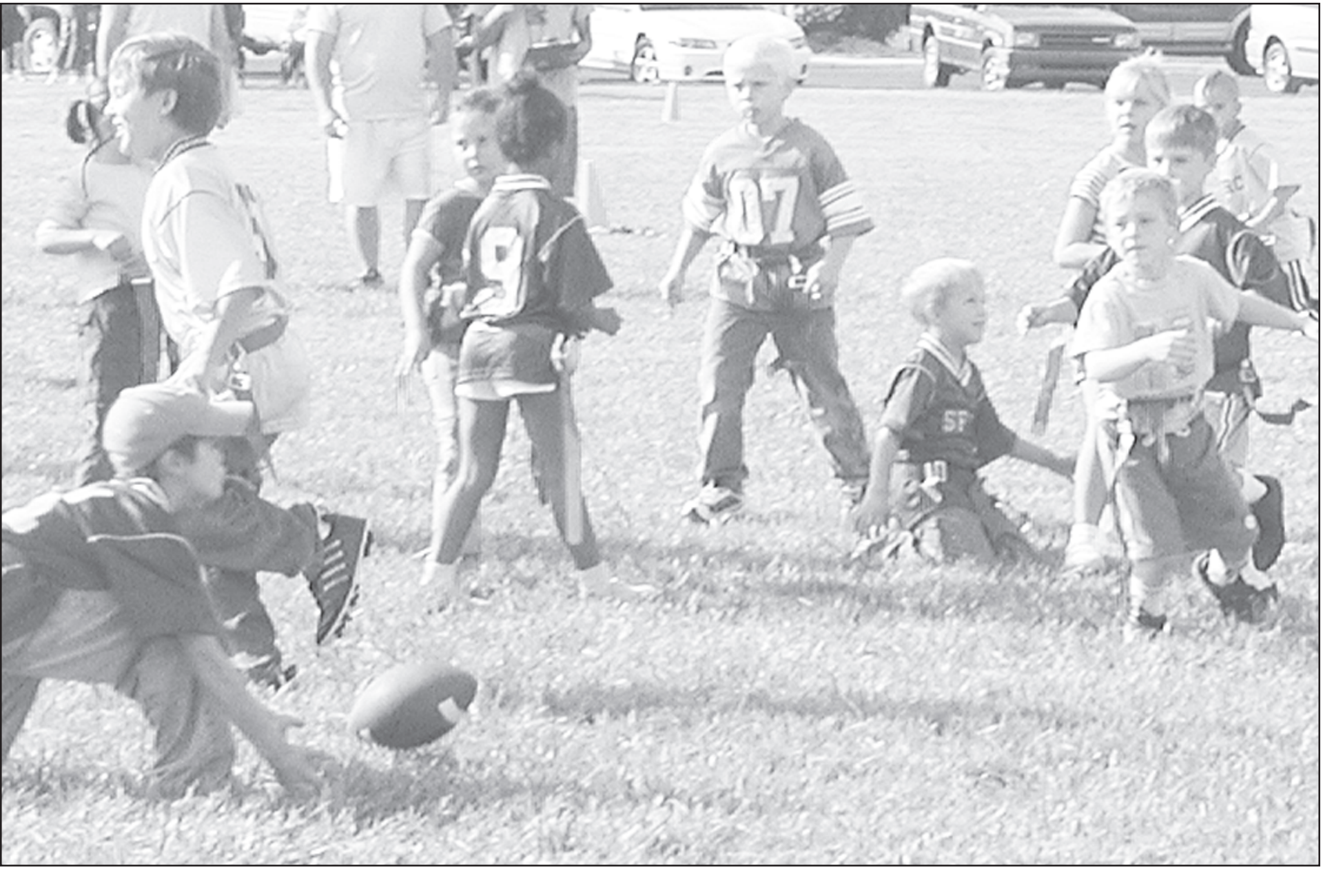
THE FLAG FOOTBALL PROGRAM, sponsored by the St. Francis Rec and the older kids. Here two of the young teams enjoy a game. Commission is popular with the players in kindergarten through third grade