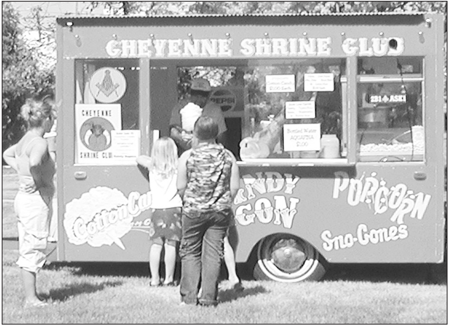
CHEYENNE COUNTY SHRINE CLUB has been very active in the community. Through proceeds, the club has sent a student to band camp, donated money to various projects to name a few.