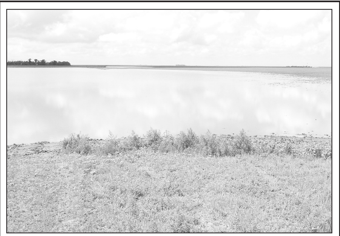
Playa lakes, "lagoons," mud holes or by whatever name they are known can be a nuisance to farm around. Farmers can turn this "headache" into cash by enrolling the acreage into the Conservation Reserve Program. The Department of Agriculture will make an annual rental payment to farmers who retire the land from crop production for 10 to 15 years and plant a grass buffer around it. Call or stop by the Service Center on US Highway 36 in St. Francis to learn more.