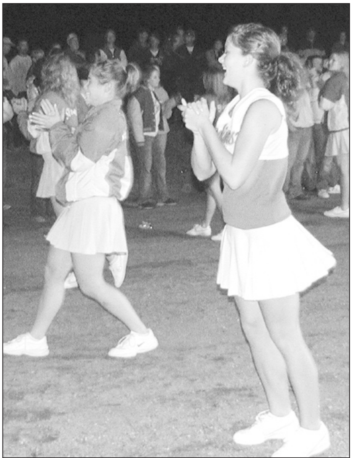
HOMECOMING WEEK students along with adults enjoy the many activities in honor of school spirit. Nothing was complete without the SFCHS cheerleaders cheering the crowd along.