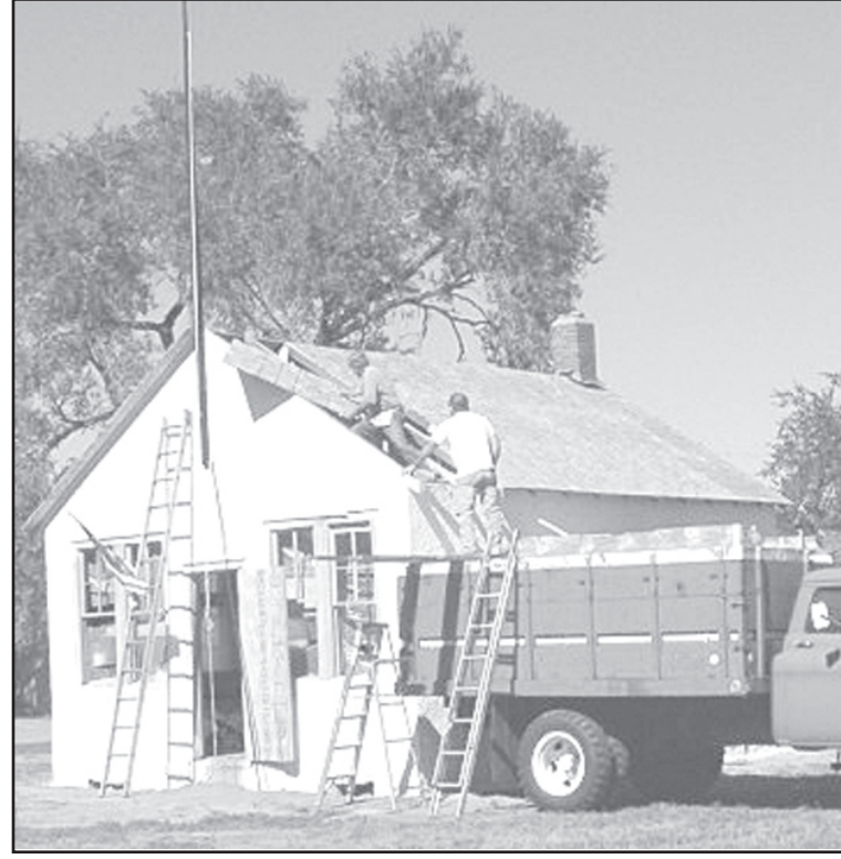
PROGRESS is made at South school building. Next spring there will be an open house and old time box supper at the school.