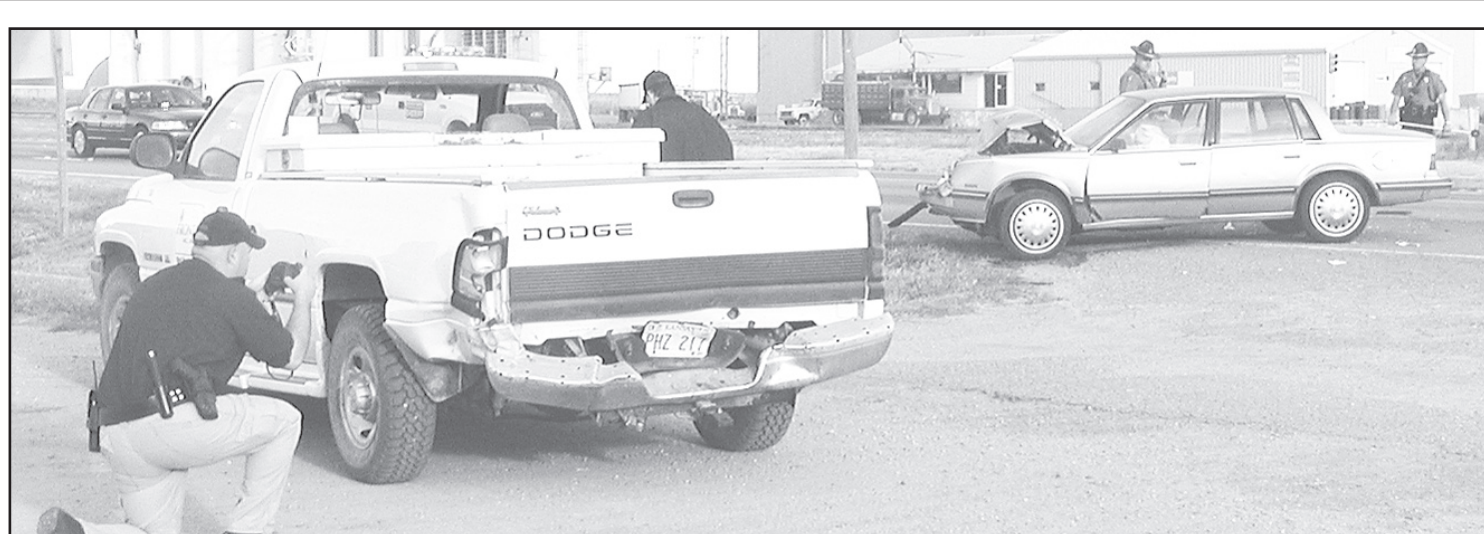
BAD START TO THE MORNING. Two vehicles were involved in an accident on U.S. 36 in Bird City last Friday. Both were east bound when the car hit the rear of the pickup. Four people were transported to the Cheyenne County Hospital.