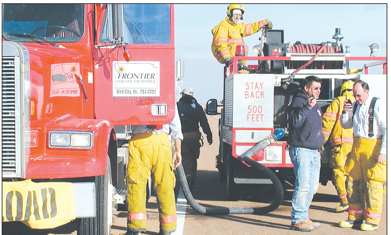
WATER CAME FROM nearby towns. Frontier Ag sent over a truck and firemen transferred the water to the rural truck.