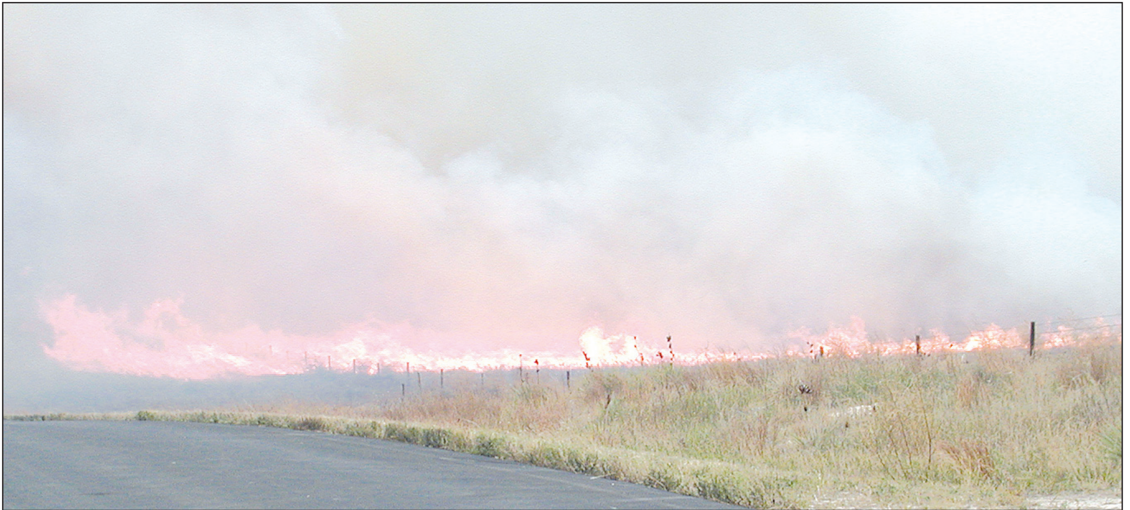
FIRE QUICKLY SPREAD , burning between 200 and 300 acres of Cheyenne County grassland. The 60 mile-per-hour wind hampered firemen's efforts.