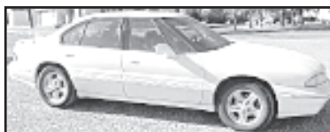
1997 Pontiac Bonneville SE Car , white, auto, AC (89,500 mi.)