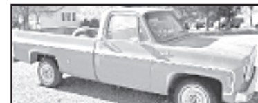
1994 Chevy Custom 10 , 1/2T pickup (83,300 actual mi.)

FOR MORE INFO & PICTURES VISIT http://midwestauction.com