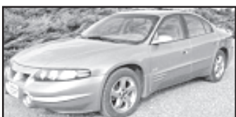
2003 Pontiac Bonneville SLE , Bronze metallic, 4 dr., Heated leather seats, sunroof, universal garage remote, XM satellite radio, rear spoiler, LOADED (28,167 mi.)

Crib & old cradle Westminster mantel clock Old records, 8 tracks Women's dress hats Coal bucket & bushel basket Old snow skis & poles Blue Boy & Girl prints Man of War picture Exercise bike & suitcases Patio set & other lawn chairs Charcoal BarB-Q & cinder blocks Handicap walker, toilet & shower seats Misc. cleaning supplies Lots of canning jars Wheel grinder Christmas candle (Bird City street)