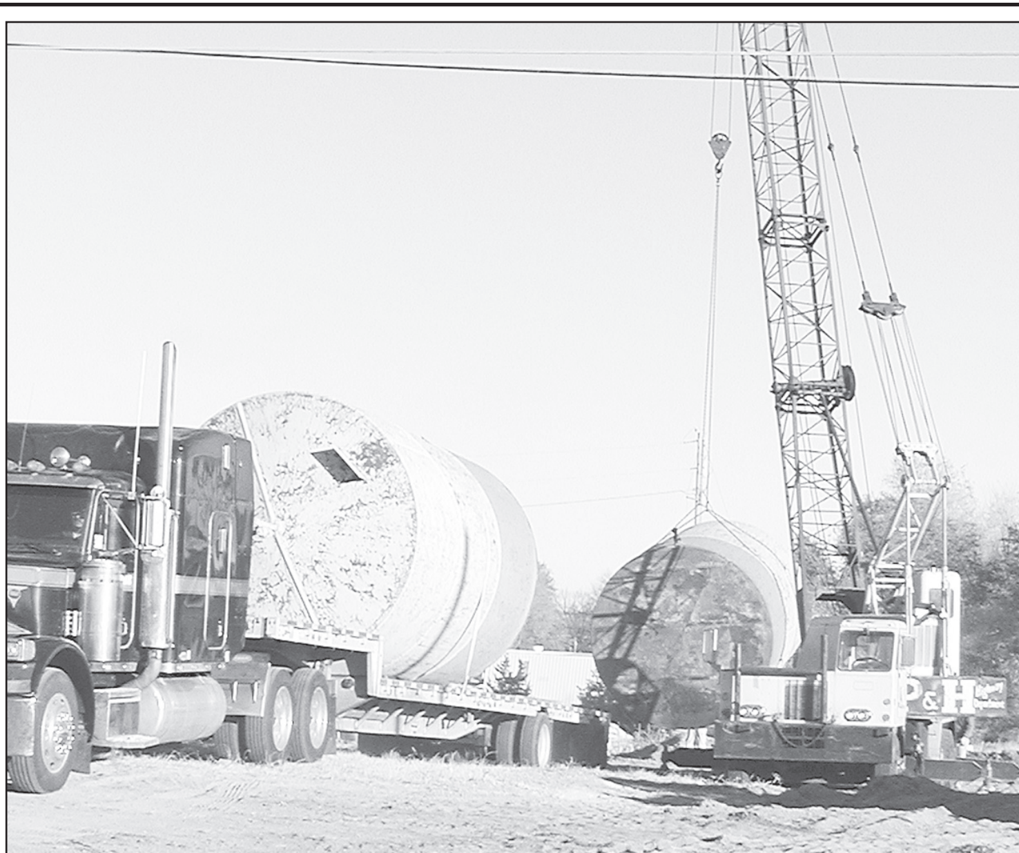
MAJESTIC GETS gas storage tanks. A Cheyenne County crane was used to unload massive fuel tanks which will be buried. Majestic Service will soon have gas pumps operating as well as a convenience store along U.S. 36.