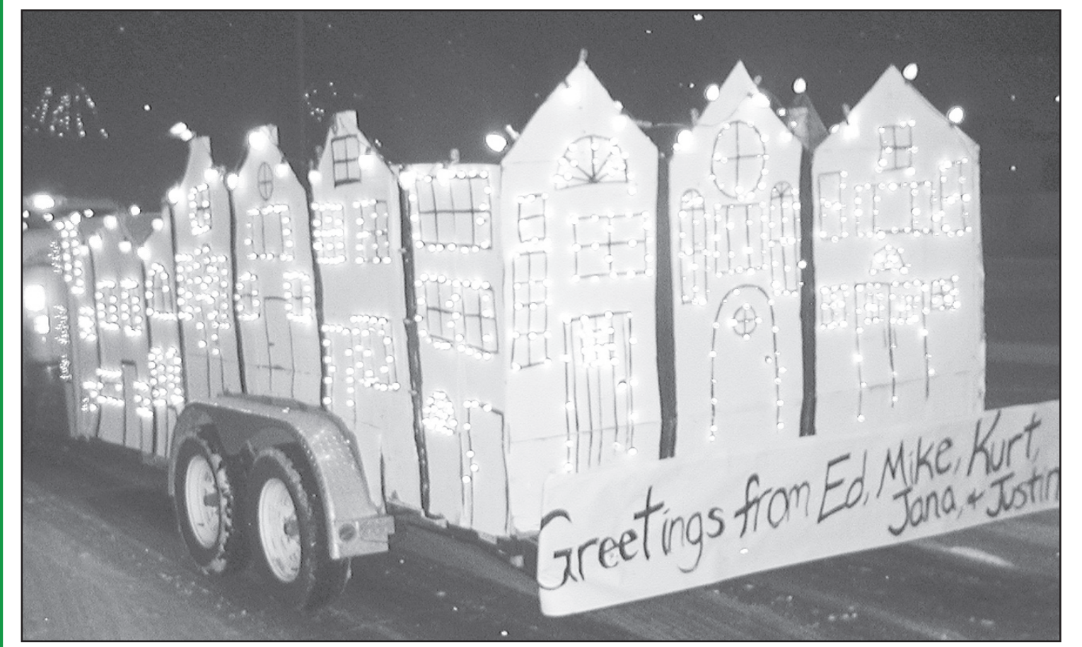
for the next year as they were the winners of the Light Parade fireworks.