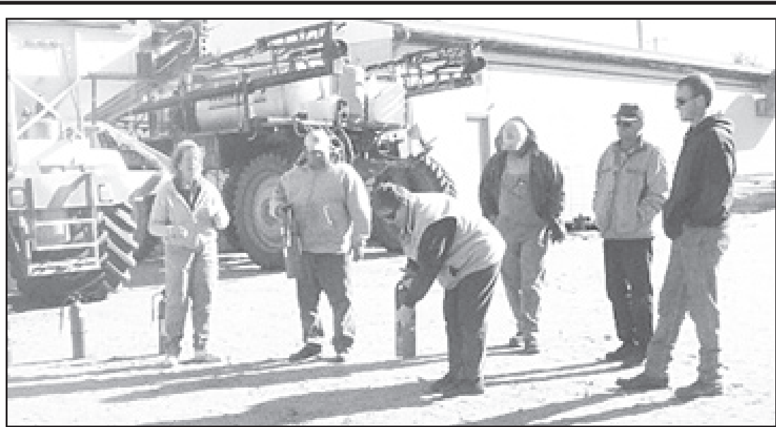
ST. FRANCIS EQUITY employees recently completed training in fire safety several weeks ago.