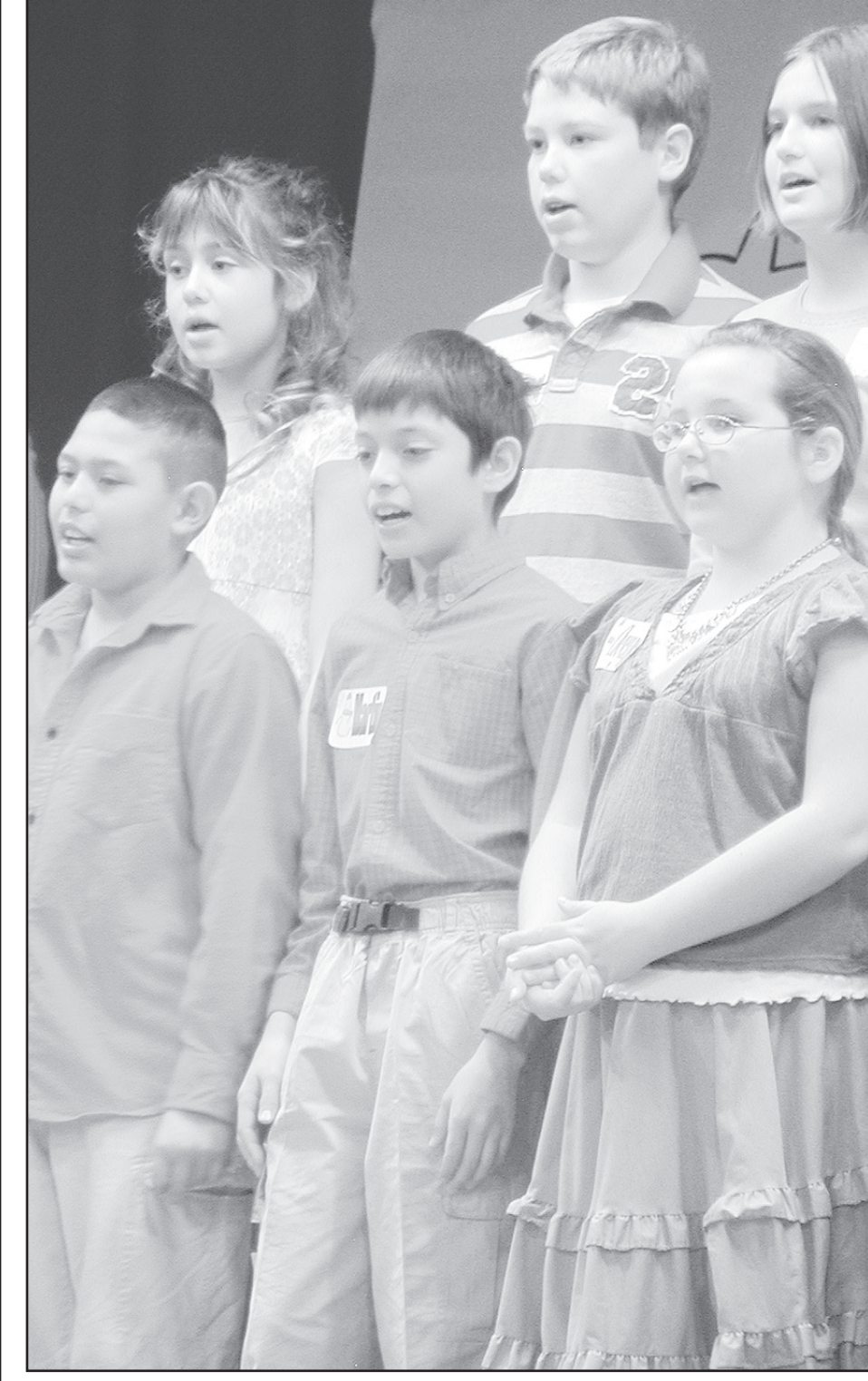
THE CHEYLIN STUDENTS sings as part of the entertainment during theanual senior citizens dinner held on Wednesday, Dec. 5.