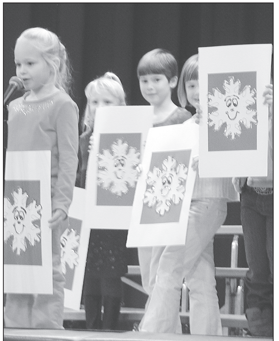
CHEYLIN GRADE school students performed several songs for the senior citizens during the annual dinner.