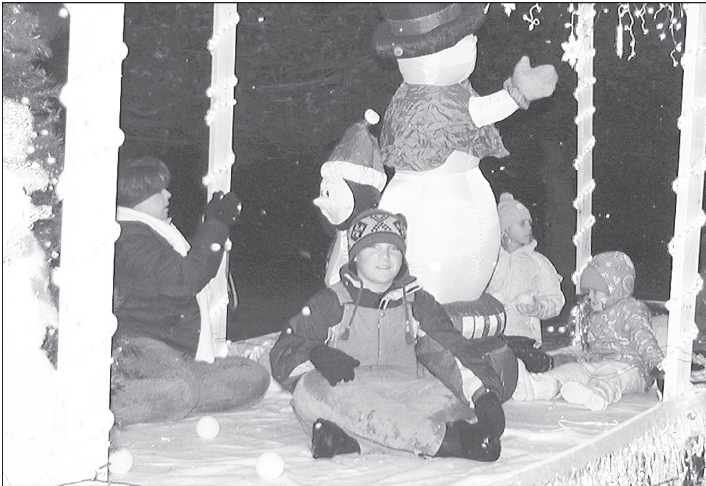
Cade Bracelin along with other family members braved the cold weather to ride the Bracelin float during the Light Parade

Melbourne, Australia has a sporting Boxing Day tradition. The Melbourne Cricket Ground hosts a Cricket test match. Sometimes this attracts 90,000 spectators. Cricket is Australia's premier Summer sport.