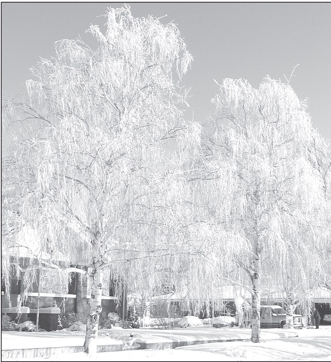
SNOW AND ICE coated trees and bushes Thursday morning. The trees at John and Elaine Kites were in all of their Christmas glory.