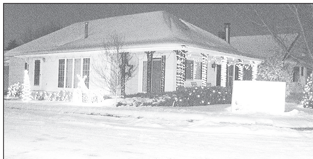
Art Krueger - 120 W. Spencer